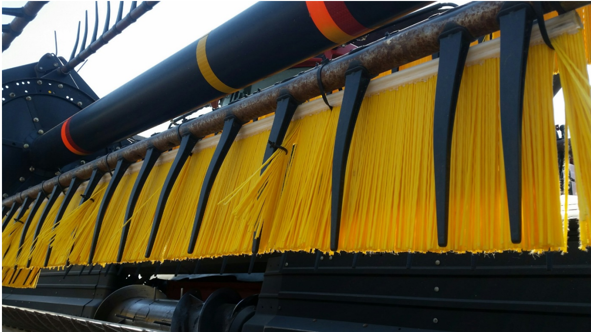
Figure 1 – Brushes attached to the header reel Bellata 2019

In 2019 three sites were evaluated with sampling away from the header trail to identify the pods or grain losses at the front of the header. Again there was no indication of pod or grain loss prior to harvest. Two of the sites had air assist fitted to the header that could be simply turned on or off. The third site evaluated lengths of brushes attached to the reel (figure 1).